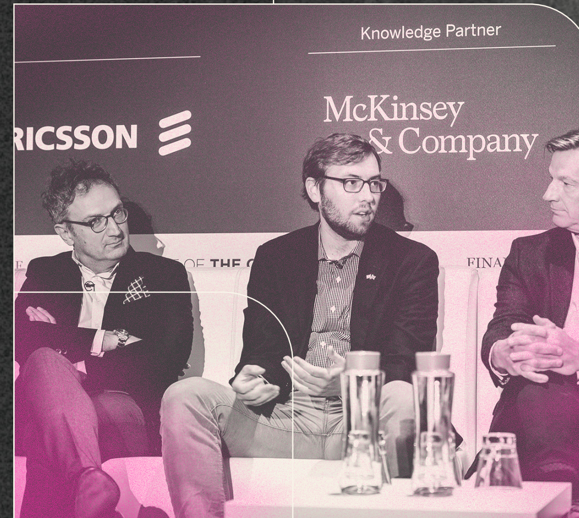
Olaf speaking at FT Future of the Car